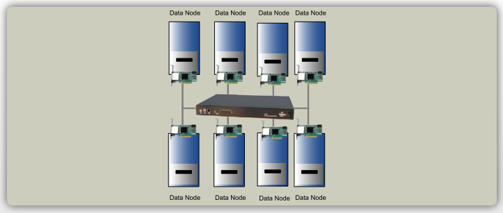
Figure 1: Eight node PXH810 cluster

low as .60 microseconds. Designed for x8 PCI Express Systems, the PXH810 supports any system with a standard x8 or x16 PCI Express slot. Gen3 operation requires a system that supports Gen3 PCI Express.